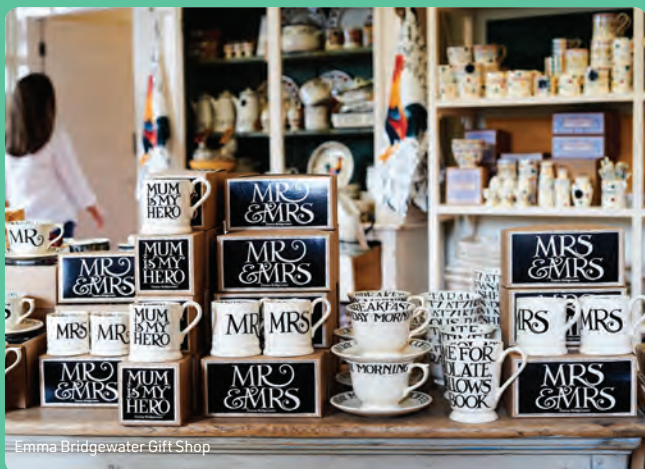
Emma Bridgewater Gift Shop