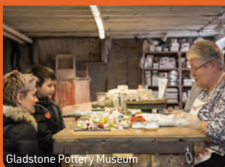
Gladstone Pottery Museum

The story of Stoke-on-Trent's history and heritage is brilliantly told through our fantastic heritage attractions. Factory tours, outstanding visitor centres and museums, and the chance to try your hand at the potter's wheel mean you'll have an entertaining insight into the history and tradition, and the modern day industry of a time-honoured craft.