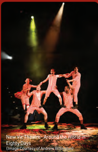
New Vic Theatre - Around the World in Eighty Days

Stoke-on-Trent has a growing calendar of exciting festivals and events including Six Towns One City, Stoke-on-Trent Festival, Hot Air Literary Festival, the Stoke-on-Trent Classical Music Festival, Appetite's Street Arts Festival and The Big Feast. The British Ceramics Biennial is taking place across numerous venues in the city in from 7 September until 13 October 2019.