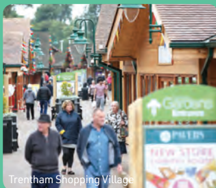
Trentham Shopping Village

As well as being the world's best ceramics shopping destination, Stoke-on-Trent has other great opportunities too.