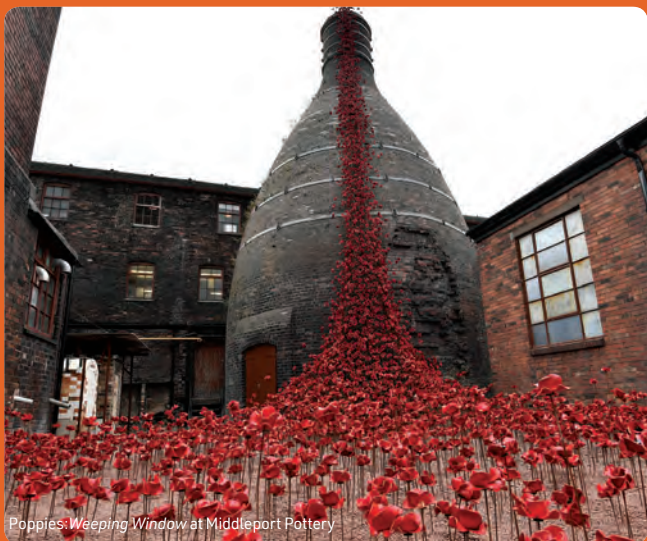
Poppies: Weeping Window at Middleport Pottery