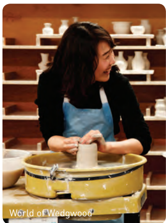
World of Wedgwood

The World of Wedgwood is a unique, interactive visitor centre experience celebrating the very best of British craftsmanship. Experience Wedgwood for the day through shopping, food, visitor tours and art and craft workshops. Experience the exquisite Wedgwood Tea Room, a contemporary English dining and afternoon tea experience.