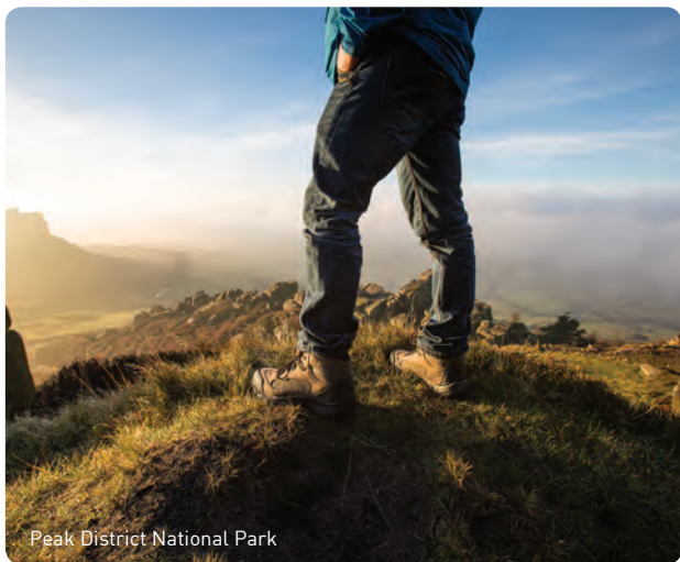
Peak District National Park

A 20 minute drive from Stoke-on-Trent will take you into the stunning beauty of the Peak District National Park. Here you'll find that the miles of moorland, dramatic crags, lakes and quiet valleys make this the perfect place to stretch your legs, cycle, climb or get active on the water.