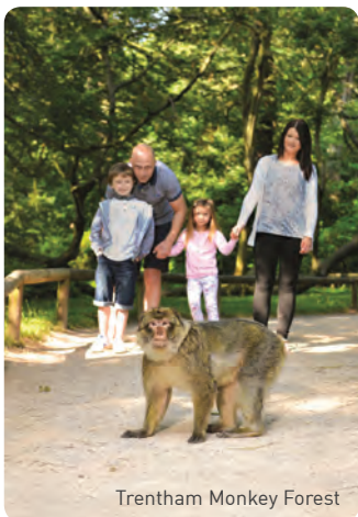
Trentham Monkey Forest

The Trentham Estate is the perfect place for a fun day out with the family. Home to award-winning gardens, scenic Capability Brown lake, adventure playground, boat and train, magical fairies, barefoot walk, newly extended shopping village and the amazing Trentham Monkey Forest where 140 Barbary macaques roam freely in 60 acres of English forest.