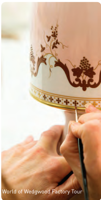
World of Wedgwood Factory Tour

And of course, a trip to The Potteries wouldn't be complete without a visit to one of our many factory shops and outlets which present exclusive opportunities to browse and buy exquisite pieces at special prices from a huge collection of china on offer.