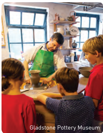
Gladstone Pottery Museum

Stoke-on-Trent is the World Capital of Ceramics.